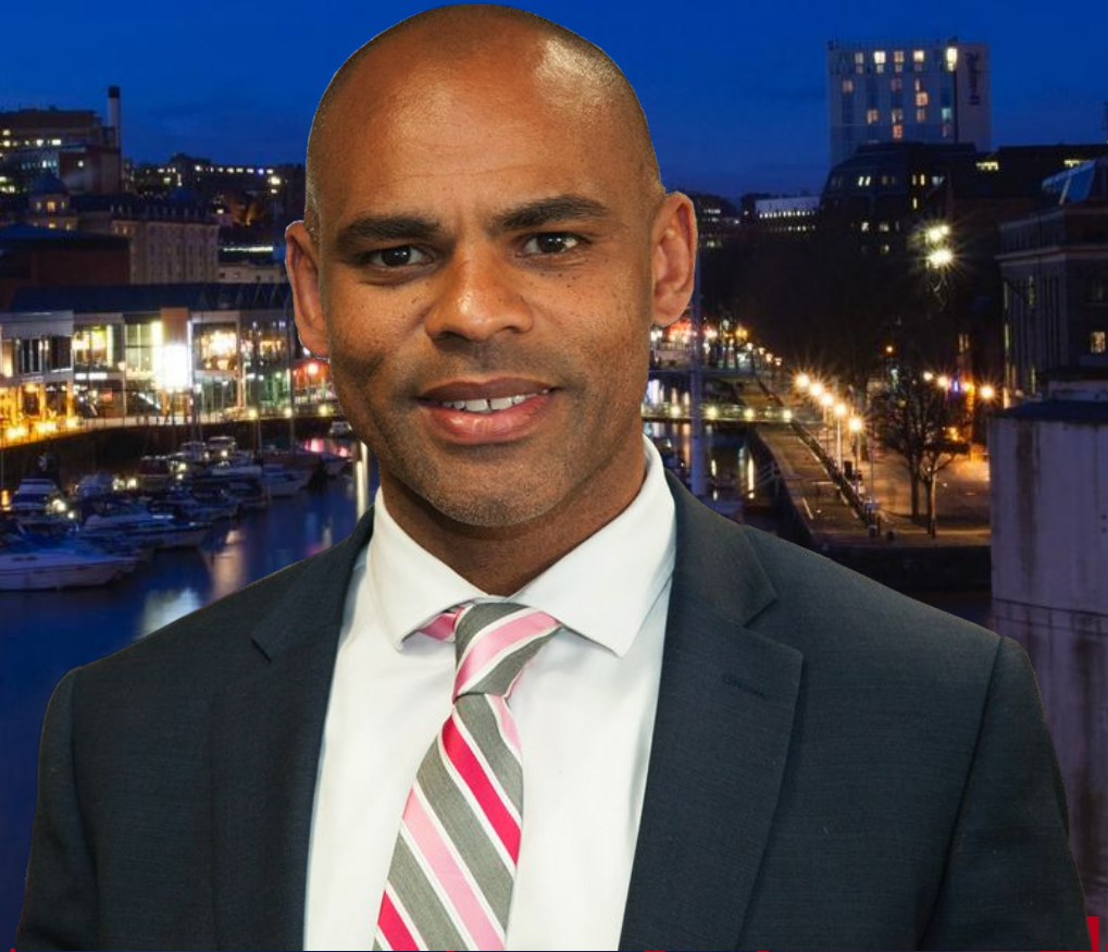
Mayor Marvin Rees

“We are committed to being a city of welcome, safety & hope for all, where everyone shares in its success”